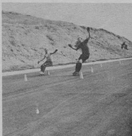
AT LA COSTA

Editor's Note: Read the "Coming Events" section to get advance notice of future exhibitions.