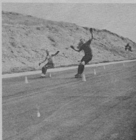
AT LA COSTA